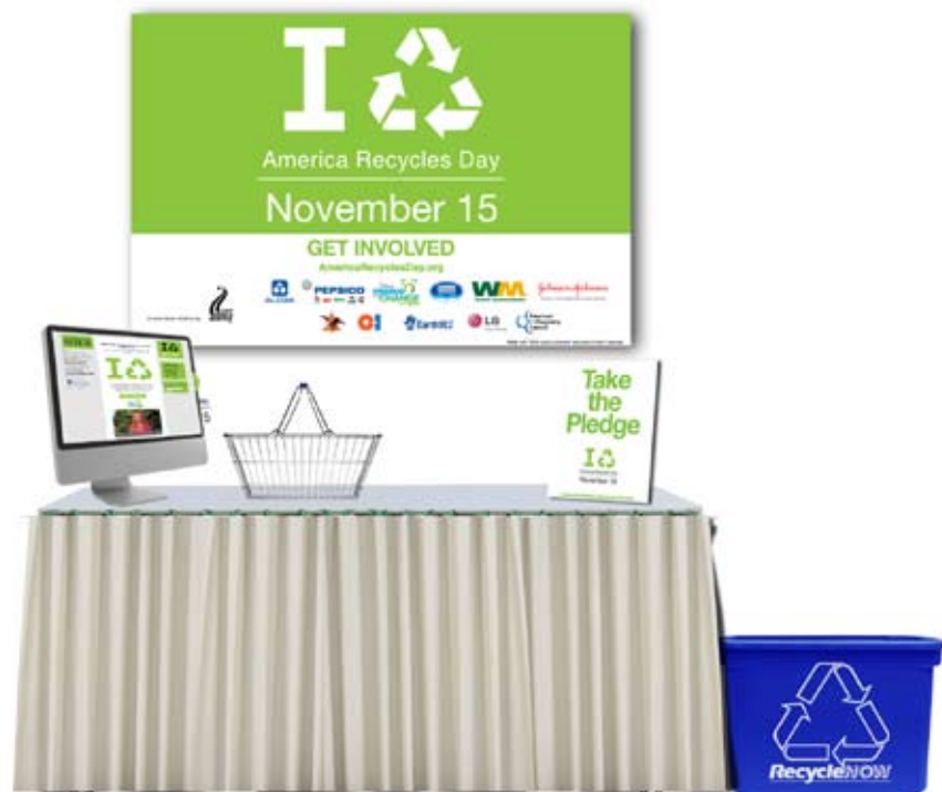
Sample Information Table

Share your results and photos to become eligible for a cash prize.